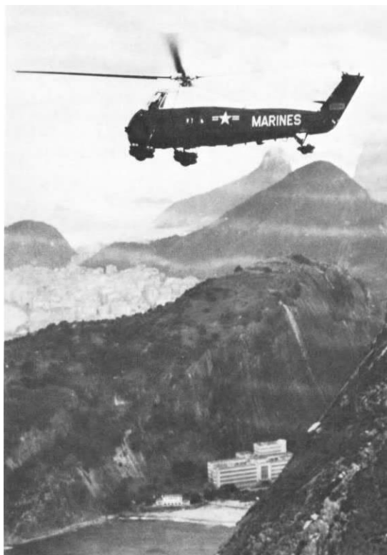
USMC Photo A329349

HMX-1 still had four HUS-1Z (VH-34) aircraft available in January 1962. These had been modified considerably with executive interiors, extra soundproofing, and numerous additional features, and required rigorous maintenance procedures designed to guarantee the safety of the President while flying in them. Regardless of these measures the VH-34 re-