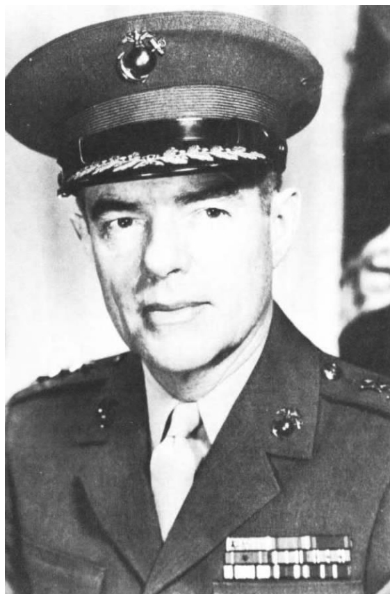
USMC Photo A409014

This flinty Vermonter would preside over the most turbulent and explosive era in the development of helicopters in the Marine Corps. On New Year's Day 1962,