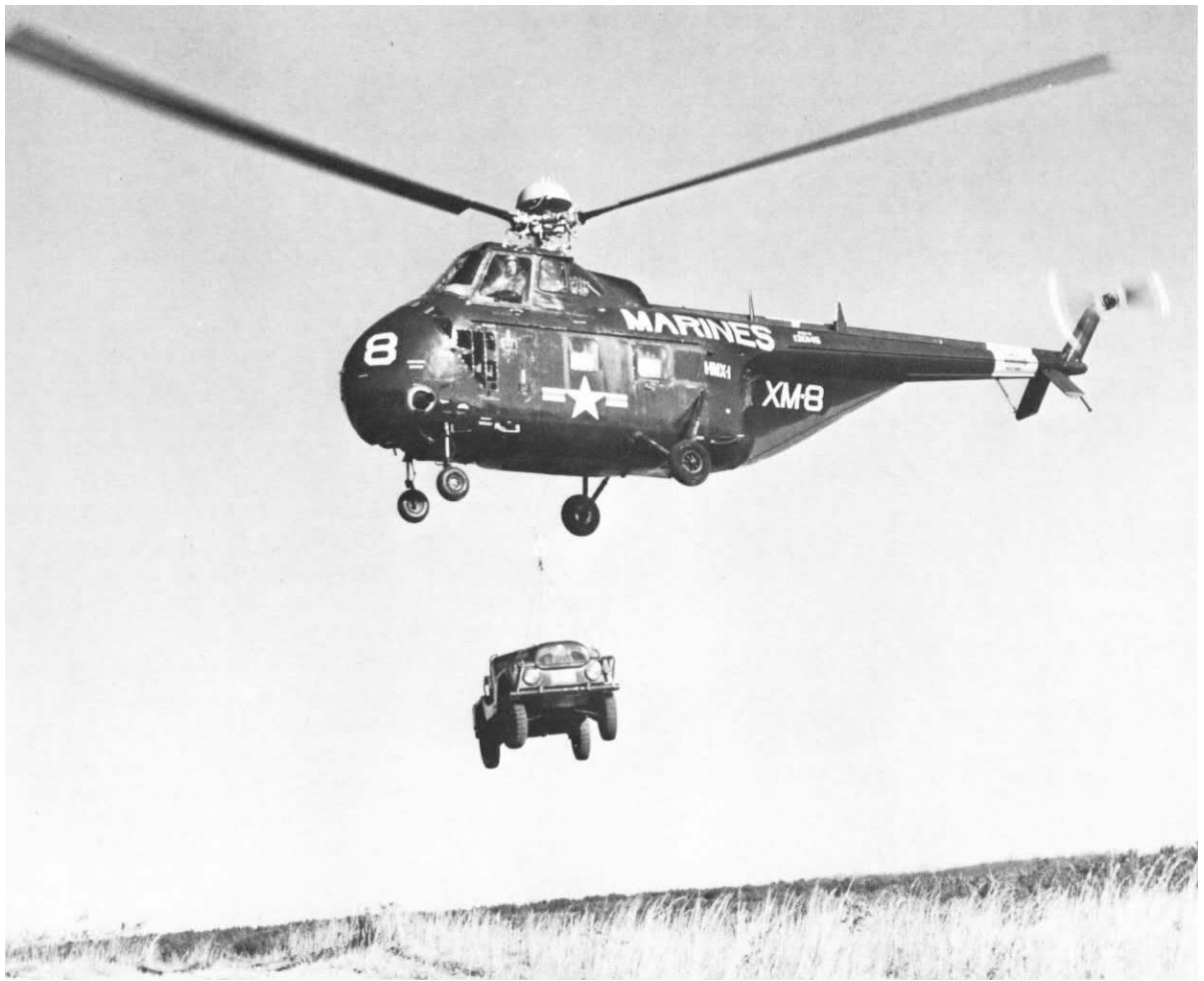
USMC Photo A324918

Long after it had been retired from assaults, the HRS-3 continued to serve the Marines in a variety of missions. This aircraft of HMX-1 is participating in a test at Quantico in 1955 and is equipped with ROR (Rocket on Rotor), the dome-like device in the center of the rotor blades, which functioned as an auxiliary power unit.