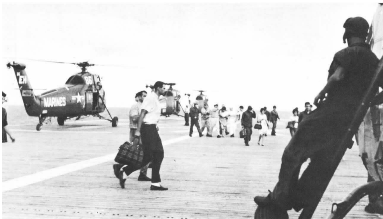
USMC Photo A19949 UH-34s of HMM-264 land U.S. civilians evacuated from the Dominican Republic on the U.S.S. Boxer (LPH 4) in April 1965. In one day, this squadron lifted 558 persons out of the revolt-torn nation.

As night fell clouds formed "right on the deck" and rain began to fall. The training in night and instrument flight became the critical factor. Leaving coordination at the ship to his executive officer "and right arm," Major Thomas L. Spurr, Lieutenant Colonel Kleppsattel led a two-way shuttle of helicopters. On each trip from the ship to the polo field, the UH-34s lifted combat Marines. On the return they carried evacuees. Utilizing a tight diamond formation of four aircraft which Kleppsattel "had always flown in 264" the helicopters took off under radar control.* Unable to see the water or the land, they relied on instructions from the radar operators to bring them to the polo field. There they were guided to a landing by a "black box." This was a series of focused beams of light of different colors which were pre-set on a given angle in the air. A pilot could land by flying the angle indicated by the appropriate color. The return trip to the ship was just the opposite, with radar assistance for the landing.