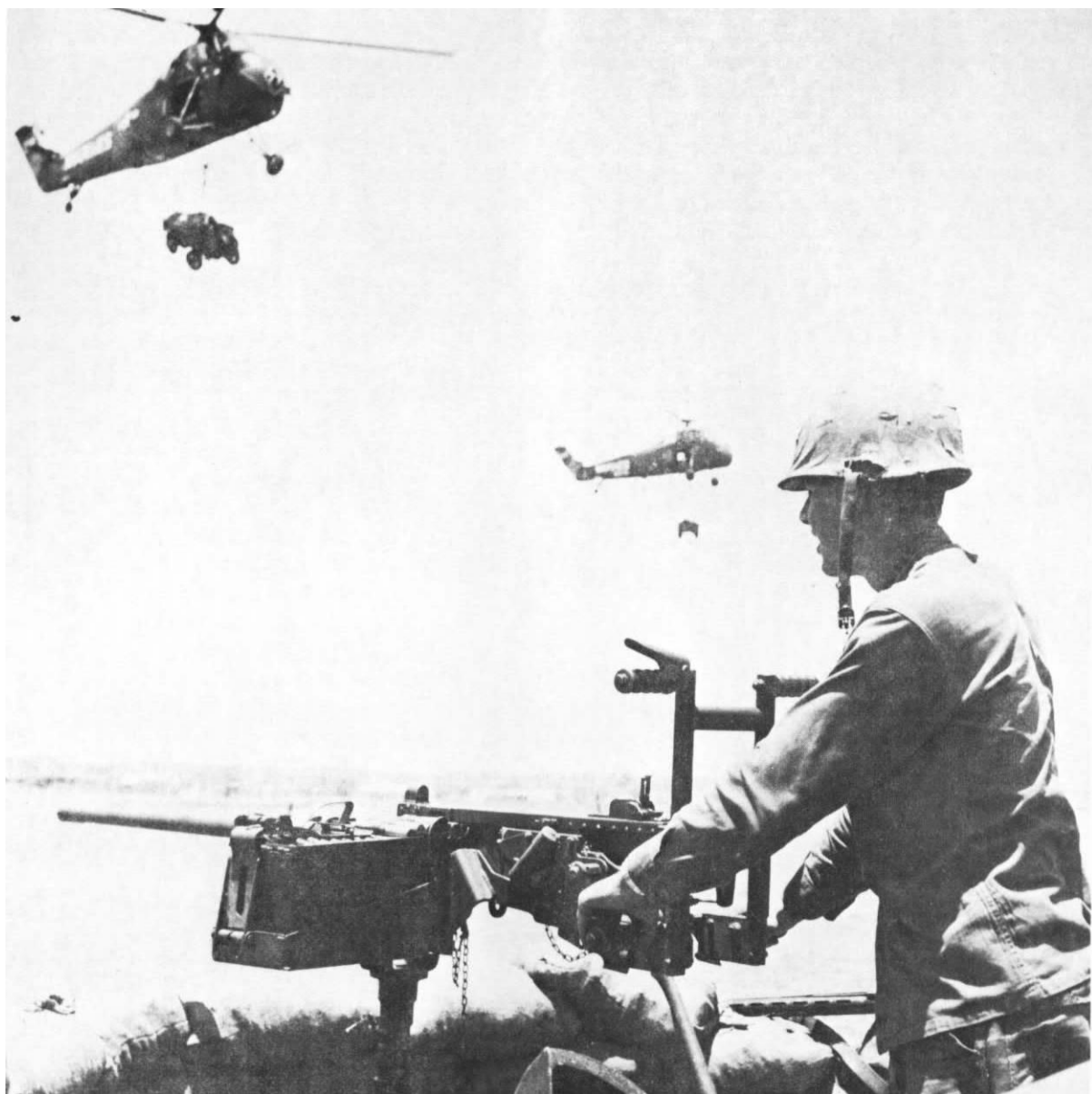
USMC Photo A19485

UH-34s of HMM-264 lift in vehicles for Marine forces establishing positions in Santo Domingo City, April 1965. The Marine aircraft operated from a polo field hastily converted into a landing field.